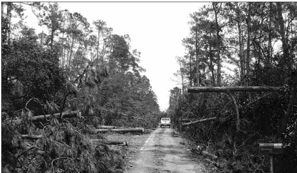
The path of destruction following Hurricane Katrina.